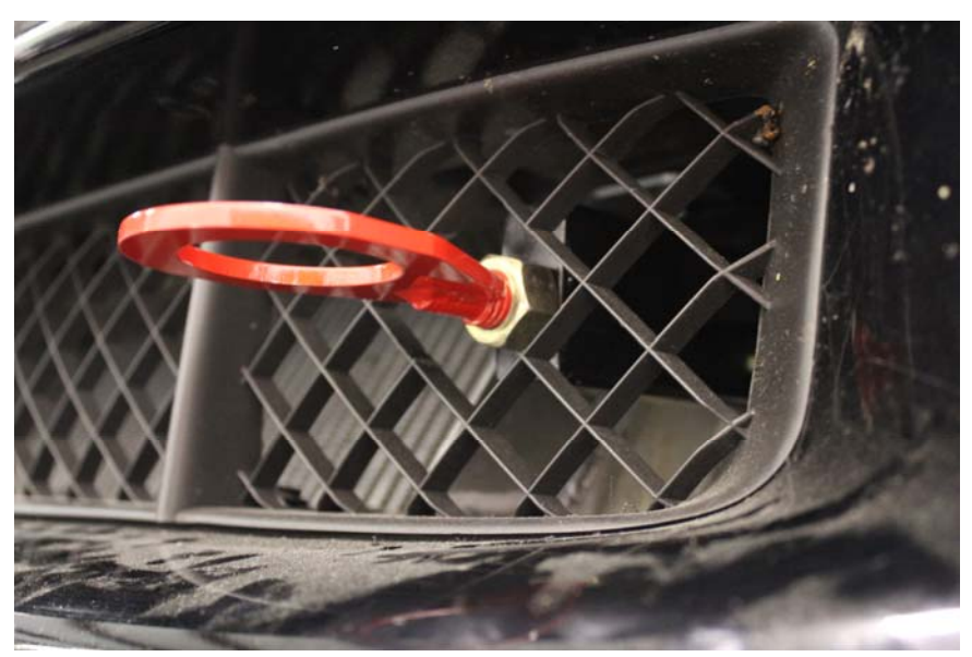
Figure 4: Hook mounted in Z06/GS/ZR1

Once you are finished, the hook should appear like the following: