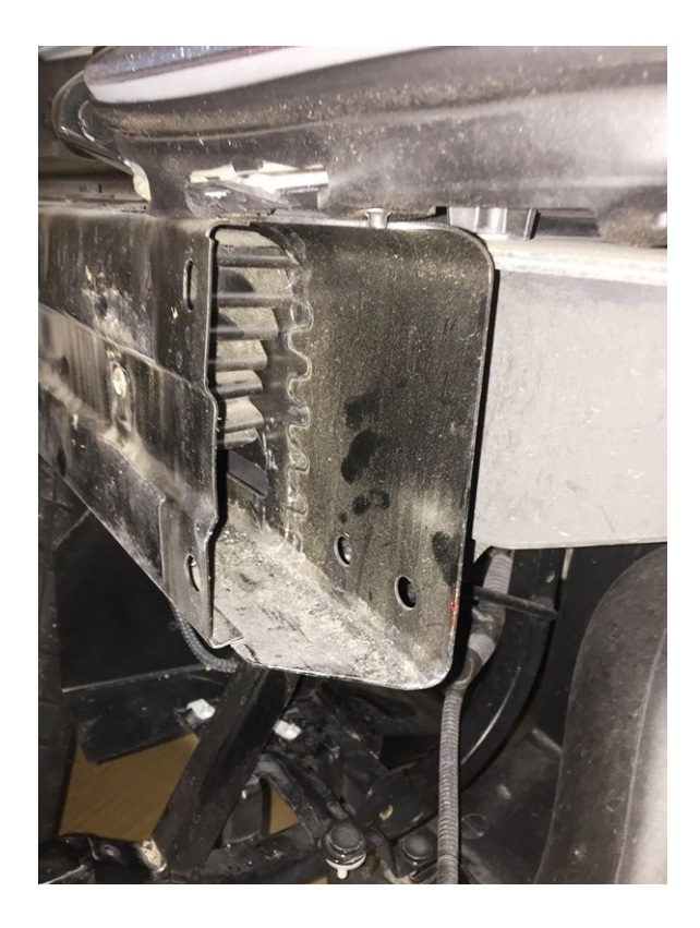
Figure 1: Detail for steel frame cars

*NOTE FOR STEEL FRAME CARS* There is a small piece of steel at the ends of the front bumper support that are spot welded and need to be removed before you are able to install the hook. See figure 1. Once these have been removed you will notice a hole already in the bumper support when looking up from the bottom of the car.