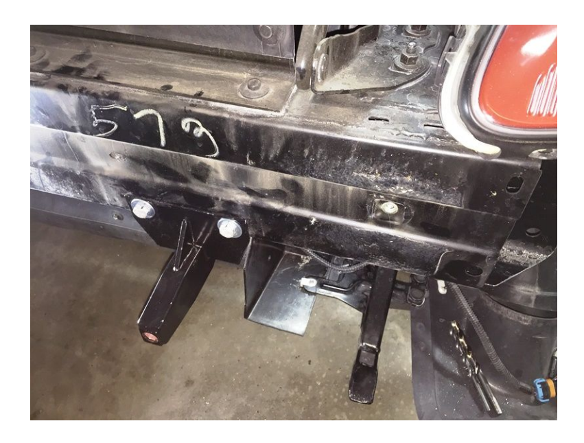
Figure 2: Hook mounted on driver side

Drill this hole open to 3/8". Now use this hole to place the location of the mount to the car, either passenger or driver side. Using one of the bolts, secure the base to the car. Use a magnet or long needle nose pliers to then place the washer and nut onto the bolt from inside the bumper support. Tighten the first bolt down, then you can drill the other remaining three bolt holes into the bumper support.