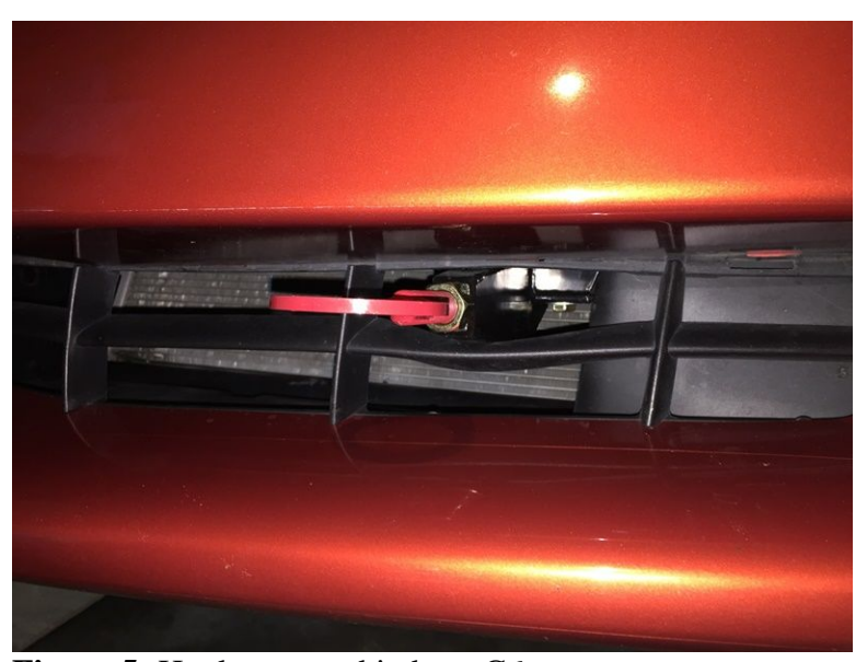
Figure 5: Hook mounted in base C6